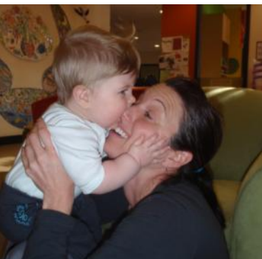
The Canberra Times 19/03/54